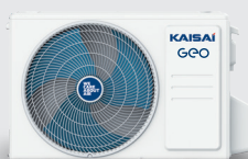
Outdoor unit KGE